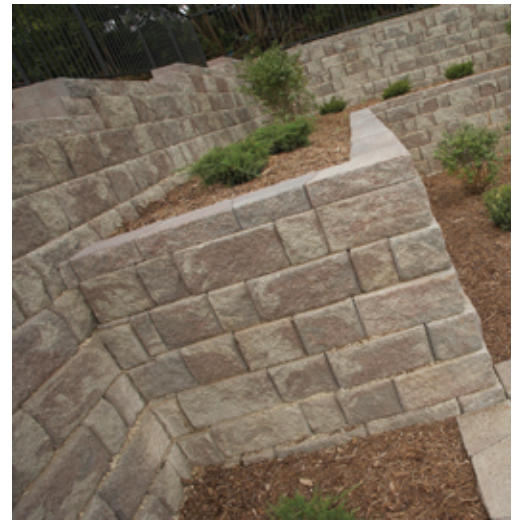
See anchorwall.com for installation instructions.

*Product dimensions are height by face length by depth. Actual dimensions and weights may vary from these approximate values due to variations in manufacturing processes. Specifications may change without notice. See your Anchor representative for details, color options, block dimensions and additional information.